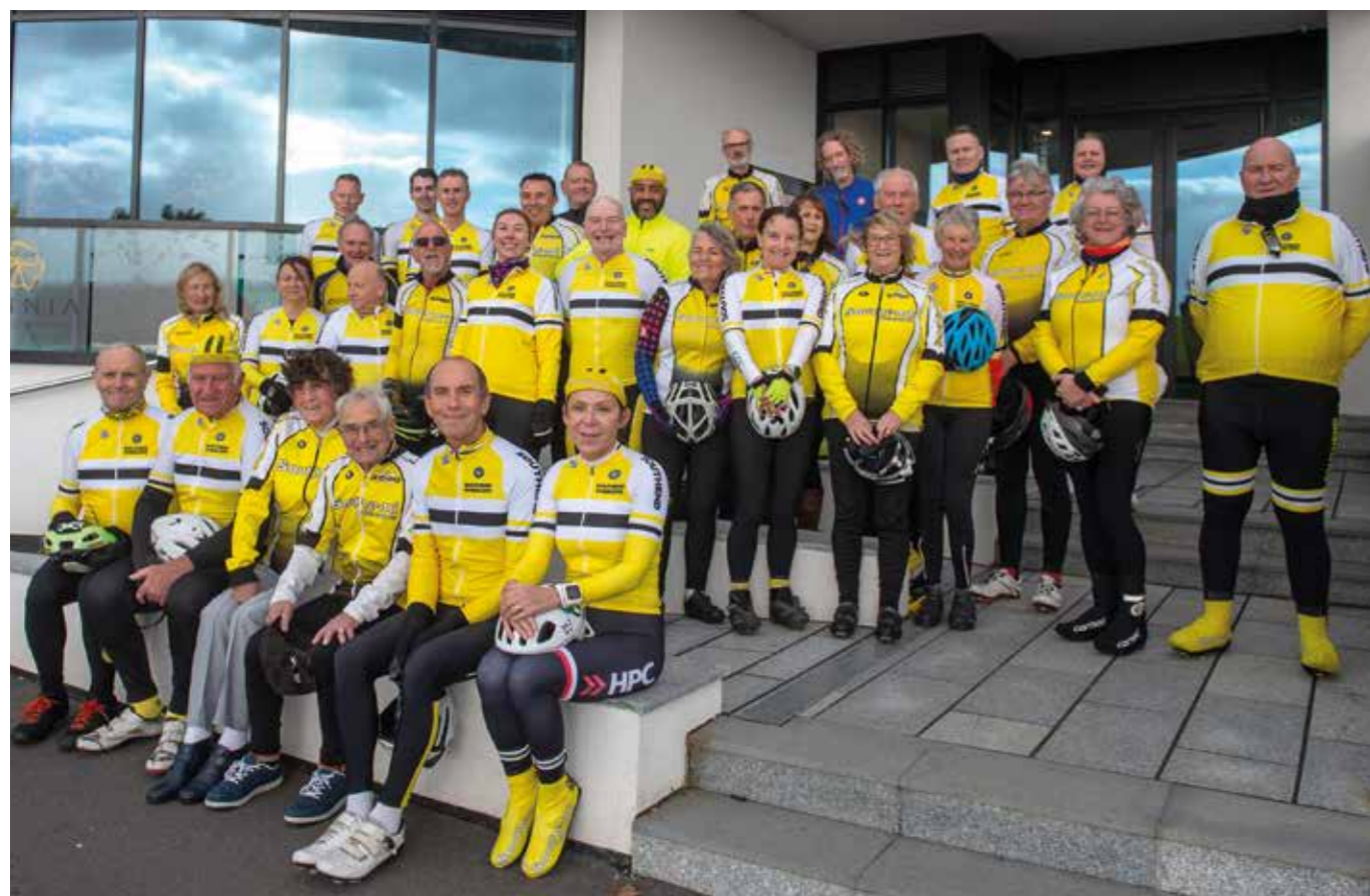
Below: 2024 Clifftown Shore, formally known as The Esplanade.