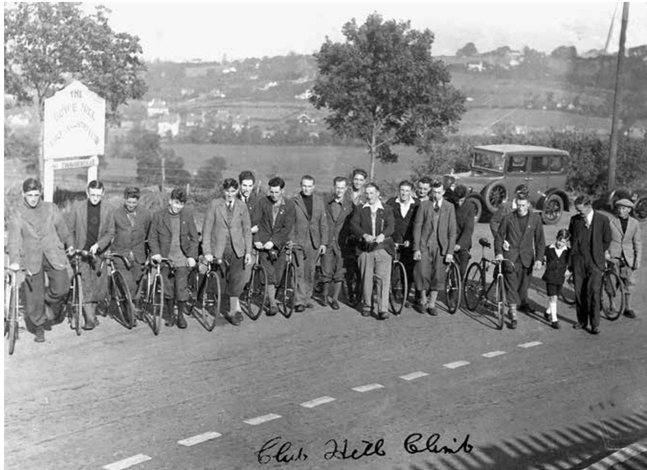
Club Hill Climb